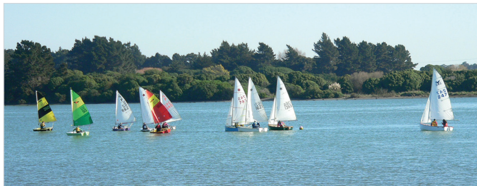
Pleasant Point Yacht Club winter race series.